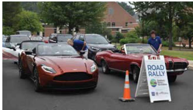
Drivers line up for the big send-off.

Our New Hope Helping Road Rally is a blend of casual driving and a scavenger hunt. With some keen observing, a little problem solving, and maybe a dash of good luck slipped in, anyone can win!