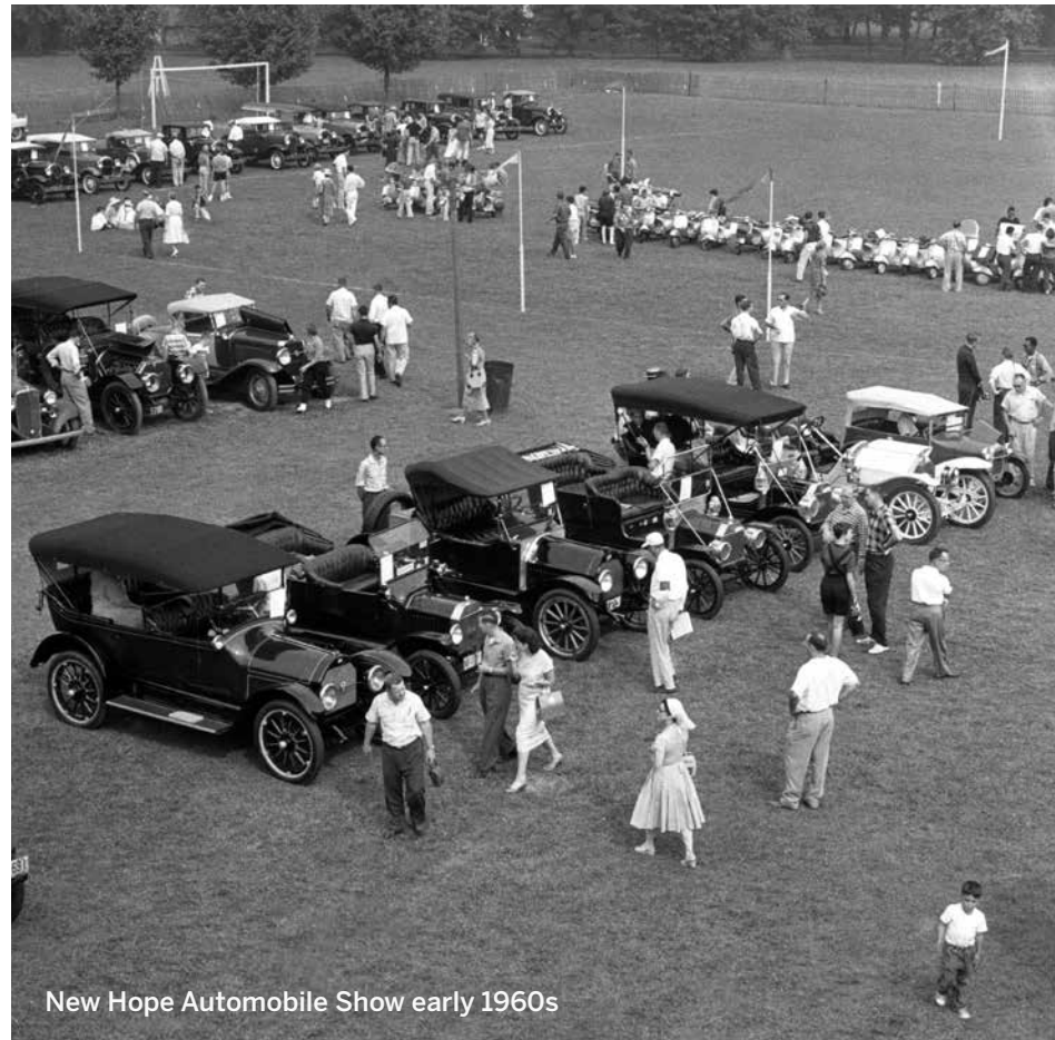
New Hope Automobile Show early 1960s